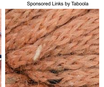
Debbie Bliss Paloma Tweed loveknitting.com